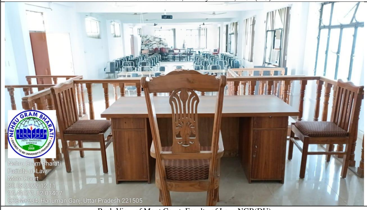
Back View of Moot Court, Faculty of Law, NGB(DU)